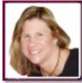
Computers/Tech Beth Sunny